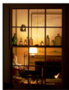
and Sally's in her living room off Ivy Lane

" Dusk to Dawn The Old Village at Night is my first book. Ten years ago while walking, I was hit by a car speeding through a stop sign. I needed to make my art, and sculpture was too difficult at that time, so I decided to photograph while recuperating. I thought a lot too about being able to walk, still being here, still able to notice the beauty all around me! In Dusk to Dawn , as the light fades, so does much that fills up a picture. Moonlight, streetlight, car light and house light bring into view small vignettes that are unnoticed during the day. My book is a gentle bedtime story for grown ups as the day winds down, and becomes quiet as night arrives. It is about seeing, and it asks more questions than it answers. There is a lot inside this little book of photographs and I hope the reader notices more to see and think about over time."