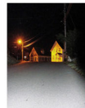
David's house glows at the top of School Street

photographs and text © 2012 Joan Horrocks