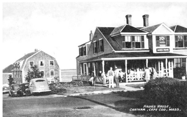
Hawes House in the 1950's