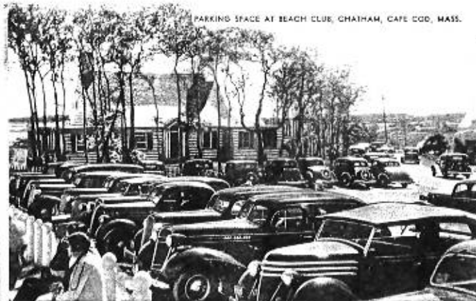
Parking problems, 1930's style. E.D. West Co. postcard discovered by the Cape Cod 5c Savings Bank. Signs attached to fence at Overlook. Dates unknown.

Old Village Association Annual Meeting Sunday August 22, 1999 4:00 PM Place to be announced