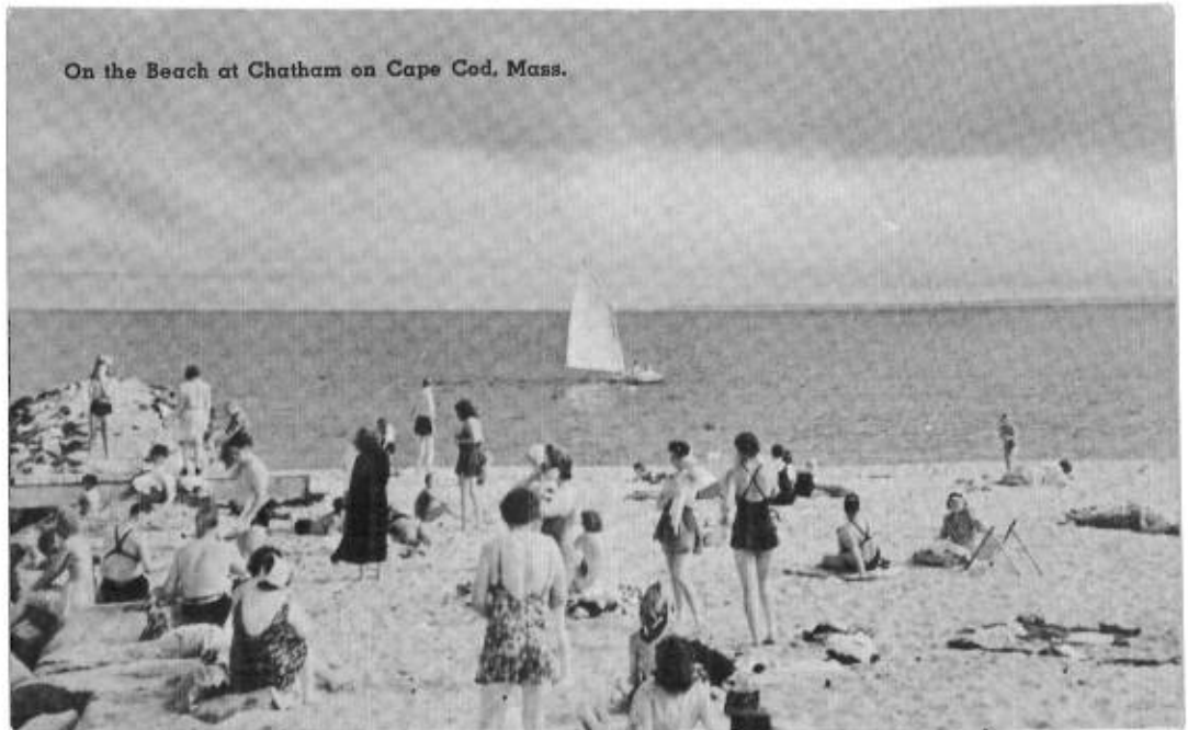
On the Beach at Chatham on Cape Cod, Mass.

As we zero in finishing the work on the National Register application, we must understand that this alone will not guarantee the future of the Old Village. The pressures of growth, rising property values and increasing tourism will continue to challenge us in the future. To keep the spirit of our neighborhood intact through these changing times will require each of us to remember the values we hold so dear and to continue to work with each other to keep for future generations what we cherish today.